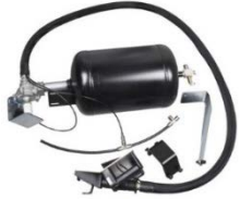
External IT kit (booster) Part number: 1695 101 372