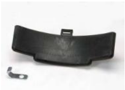
Bead breaker shovel protection Part number: 1695 106 152