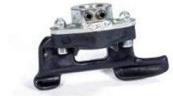
Motorbike mounting head kit Part number: 1695 103 210