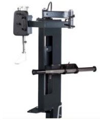
TCE 330 helper device* Part number: 1695 901 808 Adaption plate for older tyre changer model see last page