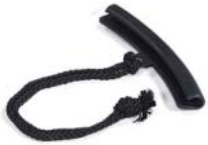
Plastic rim protection Part number: 1695 105 191