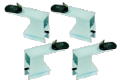
Scooter adaptors (4 pcs.) Part number: 1695 103 542