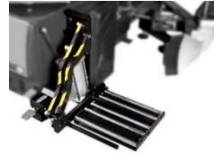
Side Lift NG Part number: 1695 107 467