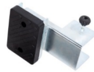
Bead breaking spacer motorbike wheel Part number: 1695 101 518