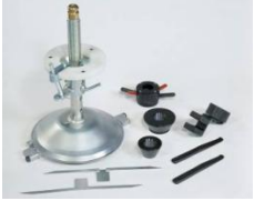
Pax wheel adaptor full set* Part number: 1695 102 666