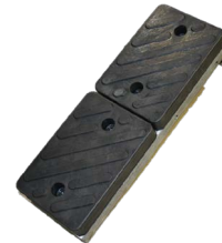
Pro-Bead breaking spacer motorbike & electro vehicle wheels Part number: 1 695 108 639