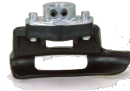
Plastic mounting head kit Part number: 1695 103 211