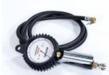
Michelin Eurodainu inflation gun Part number: 1695 042 877