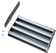
Roller board Part number: 1695 106 190