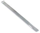
WDK tyre bar Part number: 1695 105 190