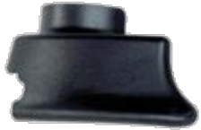
Mounting tool left cover (1 Pc) Part number: 1695 102 725