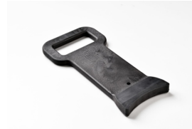
Bead pressing device motorbike Part number: 1695 104 644