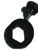
Memory ring Part number: 1695 107 490