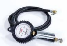
Michelin Eurodainu inflation gun Part number: 1695 042 877