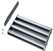
Roller board Part number: 1695 106 190