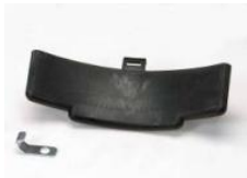
Bead breaker shovel protection Part number: 1695 106 152