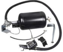
External IT kit (booster) Part number: 1695 103 858