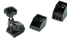
Rim clamp with spacer Part number: 1695 103 302