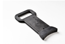
Bead pressing device motorbike Part number: 1695 104 644