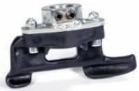
Motorbike mounting head kit Part number: 1695 103 210