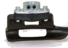
Plastic mounting head kit Part number: 1695 103 211