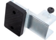
Bead breaking spacer motorbike wheel Part number: 1695 103 252